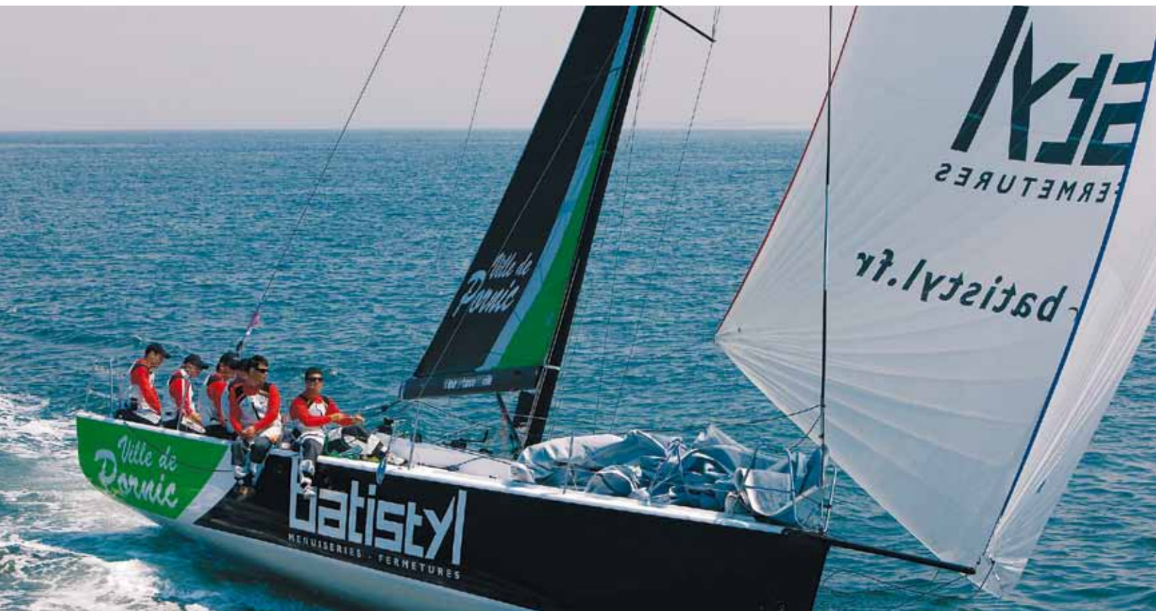
The M34 – the new Tour de France à la Voile Boat.