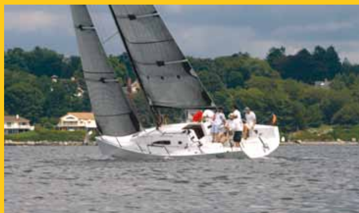
J 111, built entirely as a SmartPac solution.