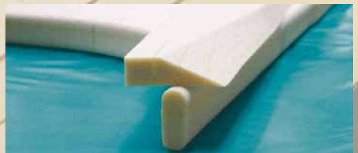
Complex shapes can be cut using 5-axis CNC machines.

The kitting facility at Gurit (Tianjin) is now very busy, so three additional expansion ovens are on order for Corecell and due to be delivered in October, making a total of 12 ovens. This new extension will allow Gurit (Tianjin) – a manufacturing site predominantly dedicated to the Asian Wind Energy market – to increase its kitting capacity by 30% and to also serve the local Asian and global marine market.