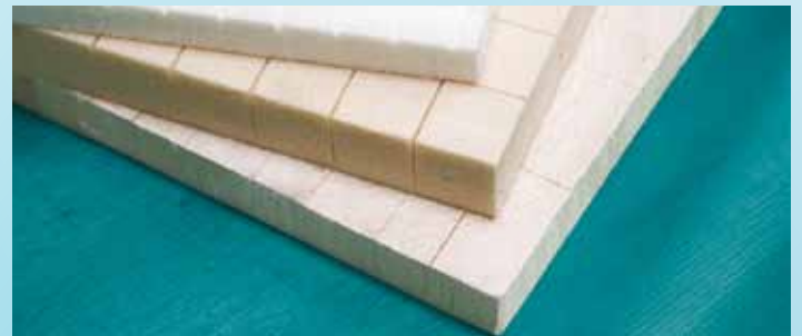
Tianjin can supply all types of core for Wind Energy and Marine applications.

themselves. Innovative use of software tools to optimise nesting and to post process parts with new machining techniques lies at the heart of such a high material yield ratio. A further customer advantage is the simplified supply that Gurit (Tianjin) is able to provide, with kits containing all required pieces for the build combining even different core materials like e.g. Corecell™ and Balsa hybrid kits.